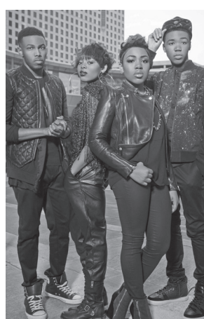
The Walls Group

Inspired by the group's multi-generational appeal, Franklin wrote and produced eight of the album's 10 songs and appears on the track, 'Beautiful.'